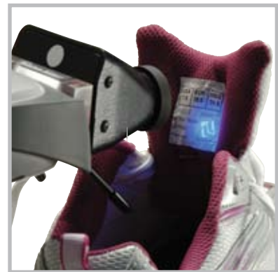
UV Invisible images appear when illuminated ultravioletly, thus, rendering them genuine.