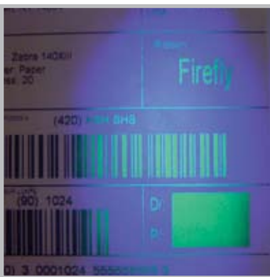
Firefly, as shown here, glows brightly under ultraviolet illumination.