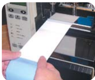
Step 2. Pull CleanStart

Simply pull it through the locked printhead at the start of each new ribbon. The result is consistently sharp bar code and text print quality throughout your entire label run.