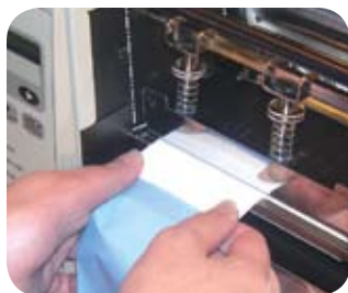
Step 1. Lock Printhead

Clean Start® is an innovative, patented printhead cleaner that's built right into the ribbon. It removes debris before it builds up on the printhead. All it takes is 6 seconds and 2 easy steps.